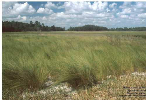
Sand Cordgrass Spartina bakeri

River Oats (1,3) – Chasmanthium latifolium (s) Muhly Grass (1,2) – Muhlenbergia capillaries (s) Sand Cordgrass (1,3) – Spartina bakeri (s)