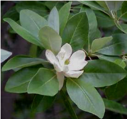
Sweetbay Magnolia Magnolia virginiana

Rain gardens offer a highly functional way to help protect water quality and prevent flooding. When designing a rain garden, think of how it will fit into your home's overall landscape design. When choosing plants for the garden, it is also important to consider the mature height and width for proper placement and spacing. Soil conditions in rain gardens alternate between wet and dry, making them tough places for many plants to grow. The plants listed below are a selection of plants for the Sarasota area that are adapted to these conditions, though some plants will tolerate more moisture than others. Each plant is marked according to its flooding tolerance: